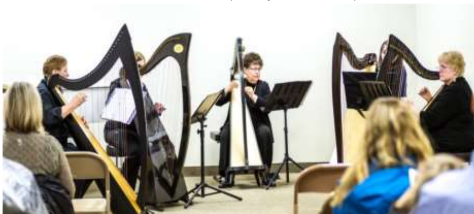
March 2, 2014 – The Tapestry Celtic Harp Ensemble

724 N. Villa Avenue Villa Park, IL 60181 (630) 290-8673 rej@net.elmhurst.edu