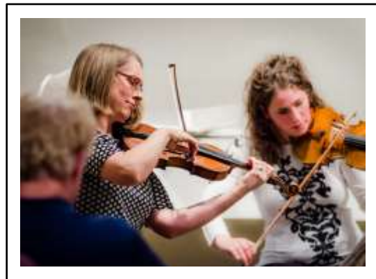
Grant Street Quartet